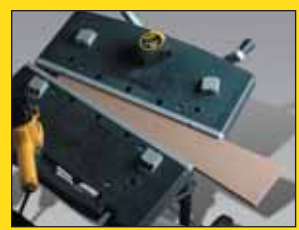
Adjustable Rotating Handles – Designed to Fit Different Angles and Positions