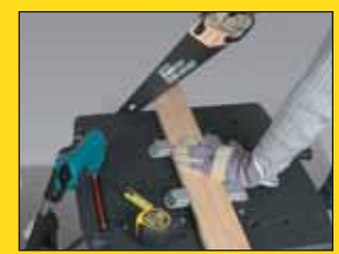
Multi-Purpose – Large Work Surface Supports 660 lbs.